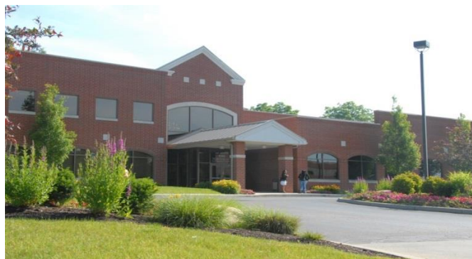
Main Campus: Westerville, Ohio

Students should be aware that there is an attendance policy in place for all classes and that they should plan for backup in case an emergency arises with regular childcare arrangements. If a child is left unattended, the Program Manager will take the necessary steps to eliminate the possibility of child endangerment.